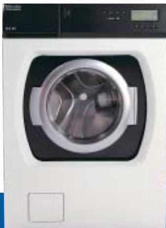
In one attractive steel casing