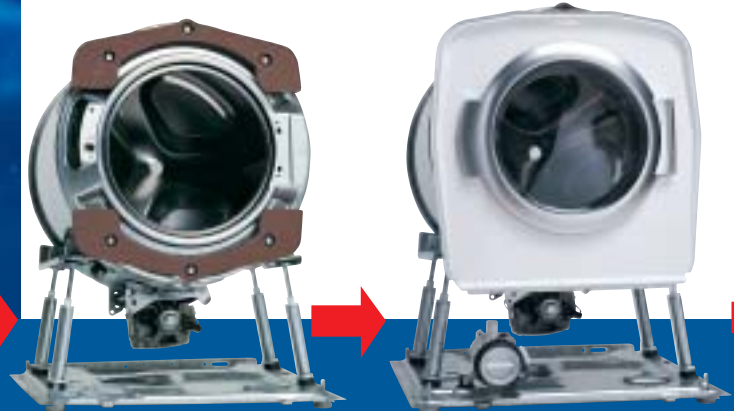
One stainless wash drum and

More steel less plastic. The inner drum is, of course, made of 18/8 stainless steel, as is the outer drum. The counterweights are cast iron.