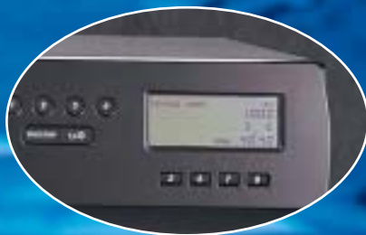
The control is simple and reliable.