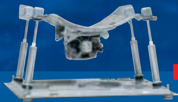
One galvanised bottom plate, four powerful spring legs,