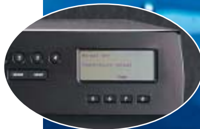
Control is simple and reliable.