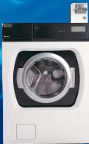
Coin operation is also available